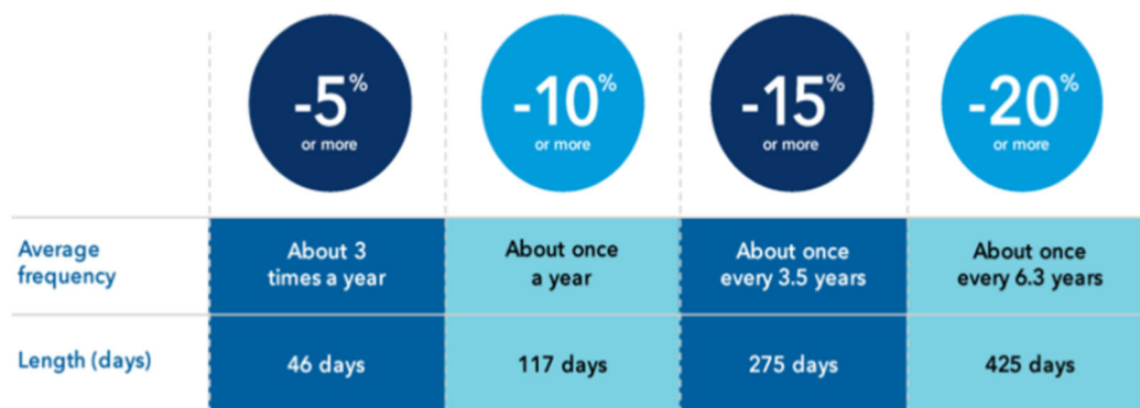
Standard & Poor's 500 Composite Index (1948-2017)

Sources: RIMES, Standard & Poor's. Assumes 50% recovery of lost value. Length measures market high to market low.