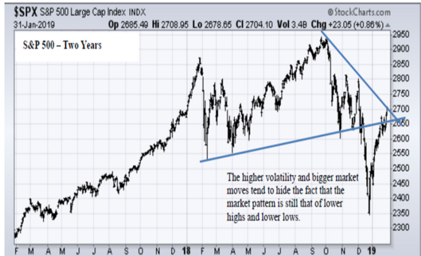
Chart courtesy StockCharts.com and RBC Wealth Management

Further underscoring the maybe verdict is the possibility of another down-leg in the market. Technical analysis (chart below) suggests stocks will fall in the next month or two and retest the